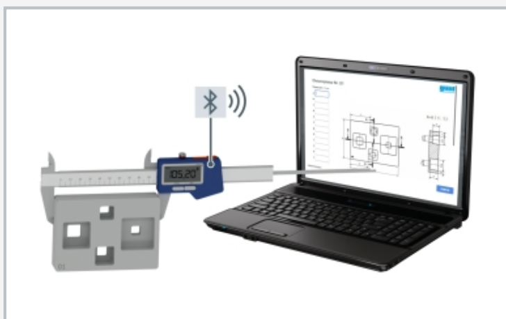
Digital calliper with Bluetooth interface enables direct transfer of measured values e.g. to the worksheets