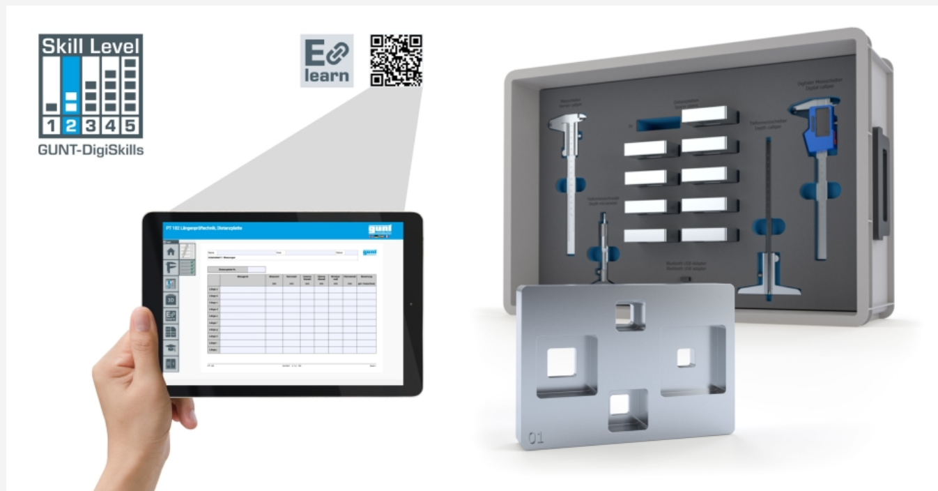
The illustration shows the device and the GUNT Media Center on a tablet (not included).